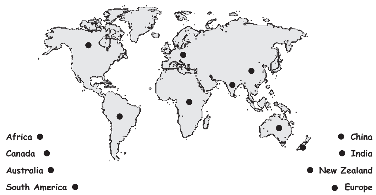
Mark the spot where you live with an "x".

Join the names of the continents and countries to where they are on the map.